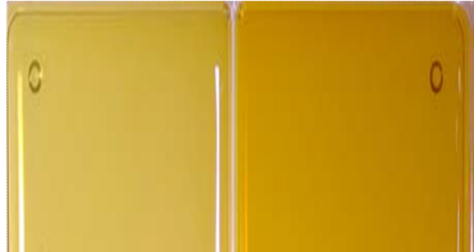
ESA DTM (un-inoculated plates)